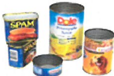
Clean metal food cans