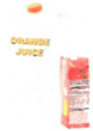
Paper Cartons - Milk cartons and juice boxes