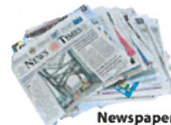
Newspaper & Inserts