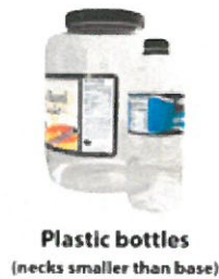
Plastic bottles (necks smaller than base)