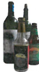
Glass jars & bottles