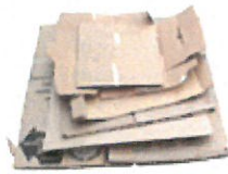
Corrugated cardboard (flattened)